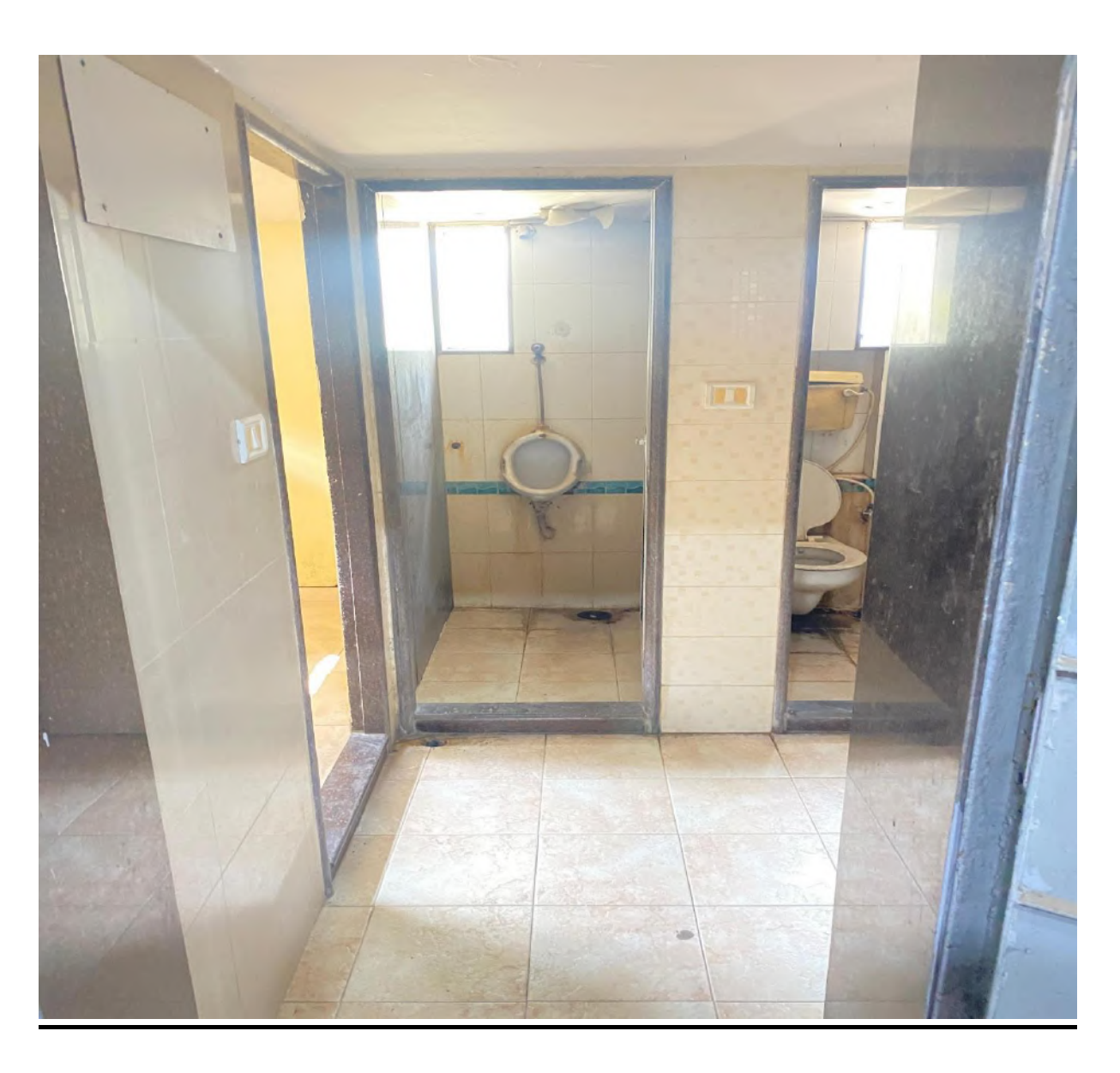
Disabled Friendly Washroom